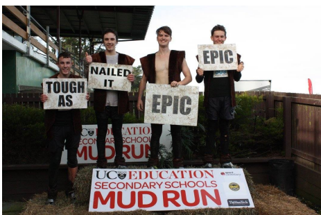
Mud Run fun - read more on Page 4