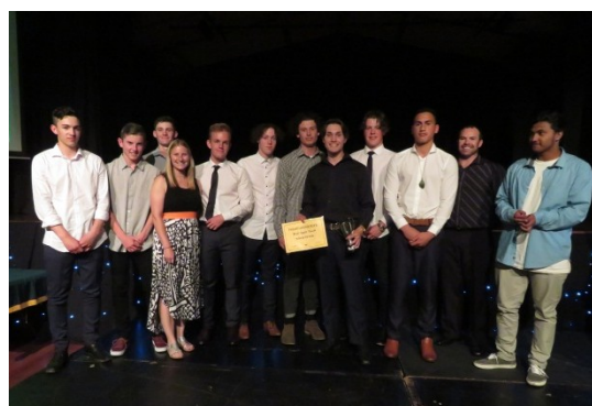
Boys Super Touch team