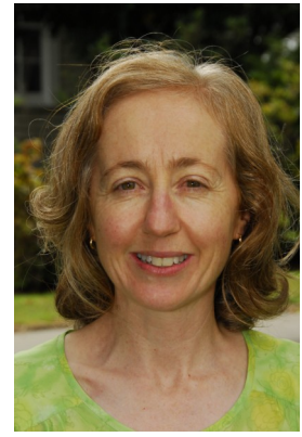
Cheryl Thompson Textiles