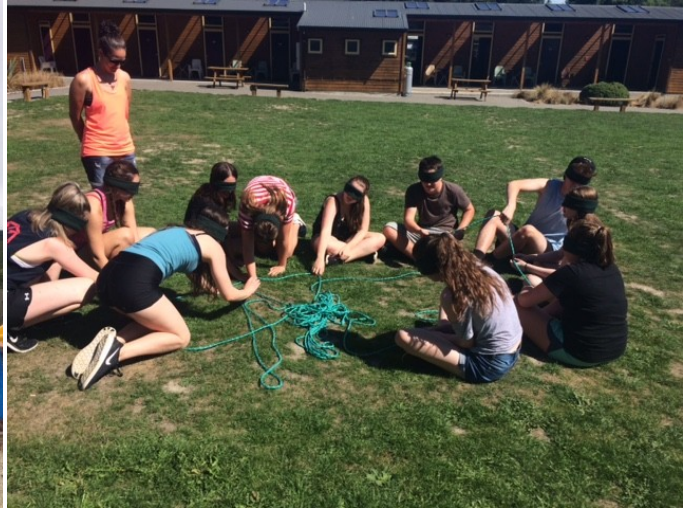
Year 13 Peer Support Leaders at the three day camp at Hanmer Springs