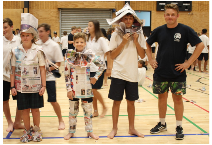
Peer Support Leaders with new Year 9 students during orientation at the 'newspaper fashion parade'