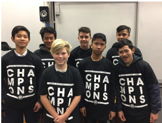
Junior Yellow – Junior Pool Winners