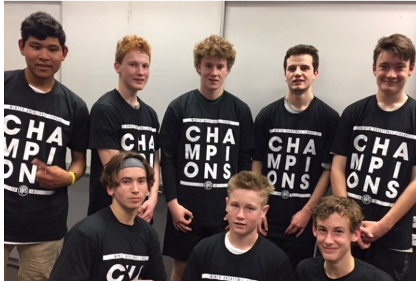
U17 Blue – Senior Pool Winners

Have you competed in a Sports Competition lately? Send your story and results (with pictures if possible) to Kirsten in the Sports Office – hk@papanui.school.nz