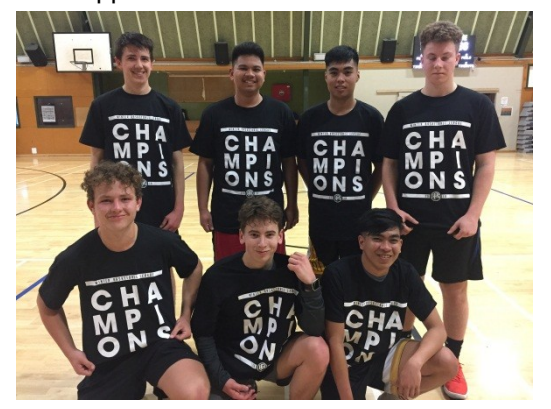
Winners - Yr 13 Green

Also thank you to "Withers and Co" for producing the 'Winners' Tops and donating spot prizes for the final games – much appreciated.