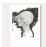
ABBY BAILLIE 'Burnt' $200 cash prize