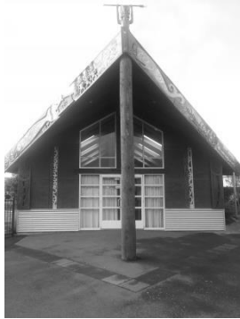
Te Whatukura o Papanui (Whare/House)