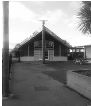
Te Whatukura o Papanui (The House)