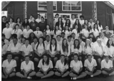
Whānau Form Class