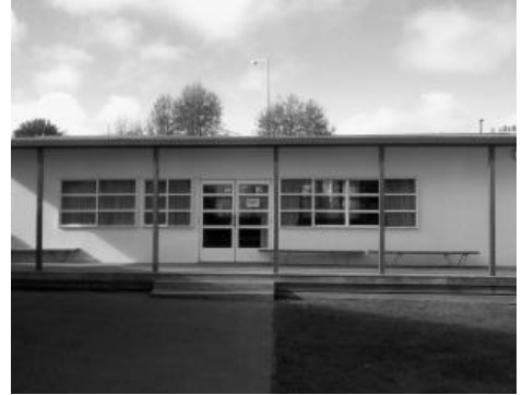
Te Pataka o Taraka (Wharekai/dining room)