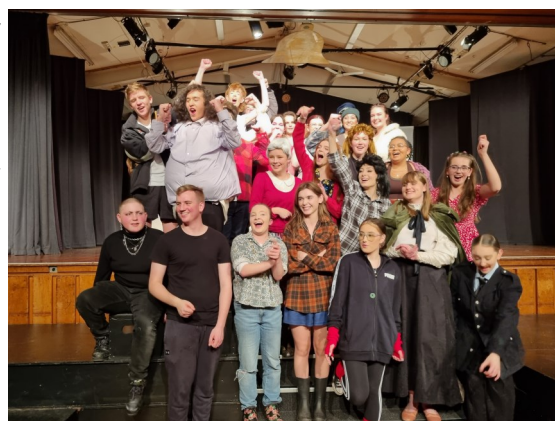
The cast of 'Wheeler's Luck'