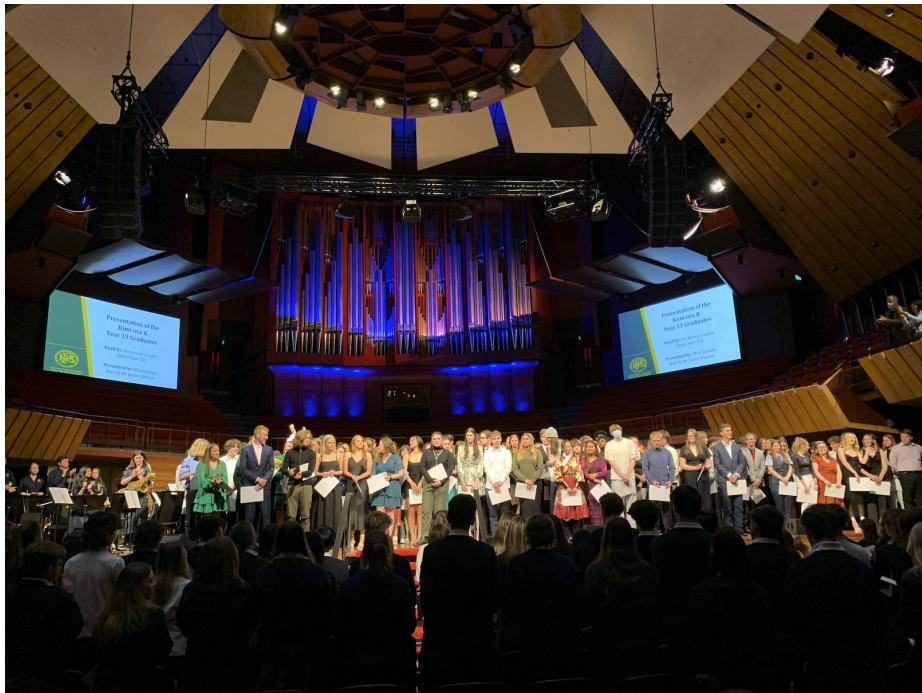
The Year 13 graduating class of 2022